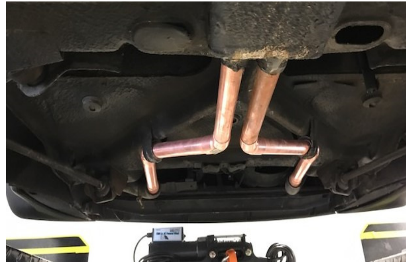
Looking forward from the back towards the radiator...