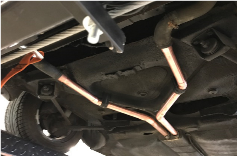
Looking from the front towards the back...