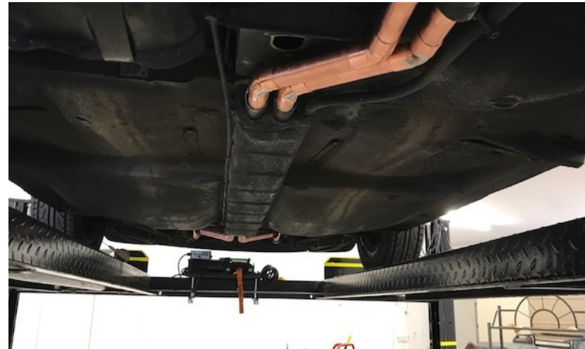
Looking forward from the engine.