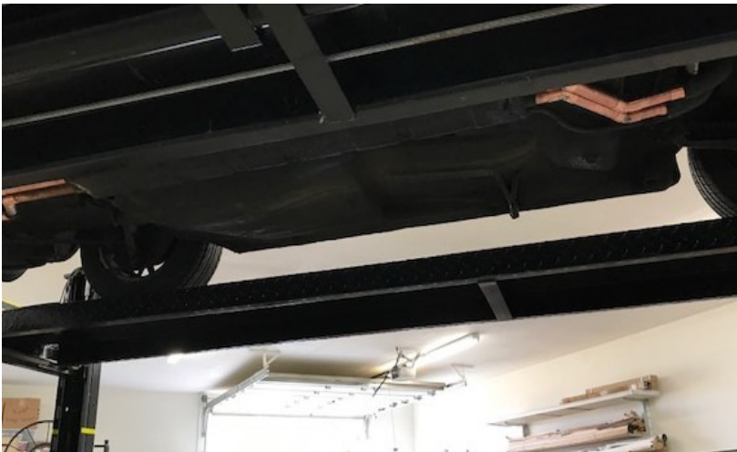
Left side view...